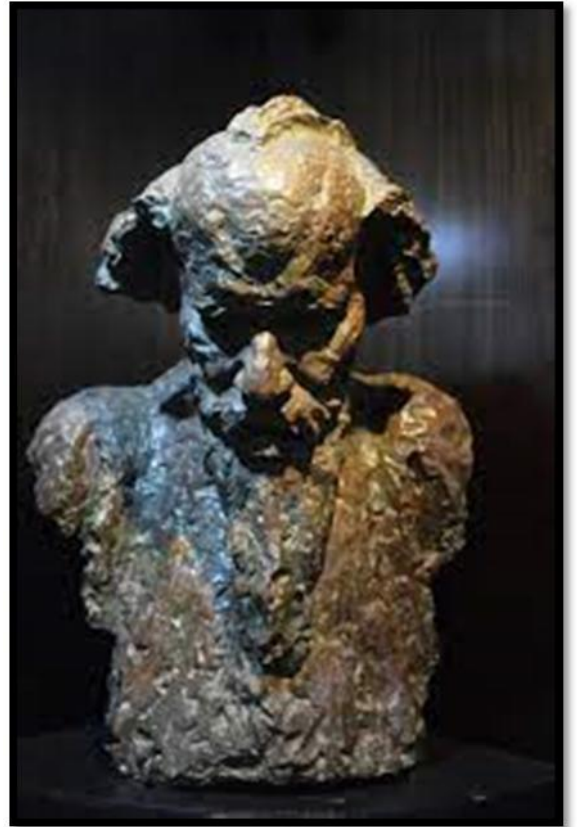
Sculpture of Rabindranath Tagore By Ramkinkar Baij