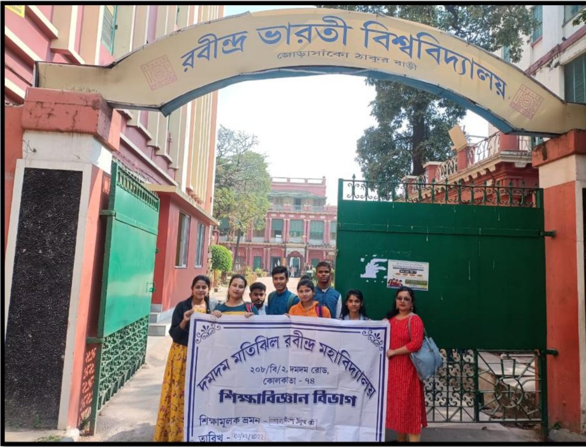
Students of Department of Education DDMRM