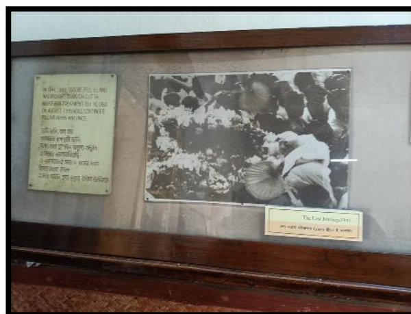
The Last Journey of Rabindranath Tagore