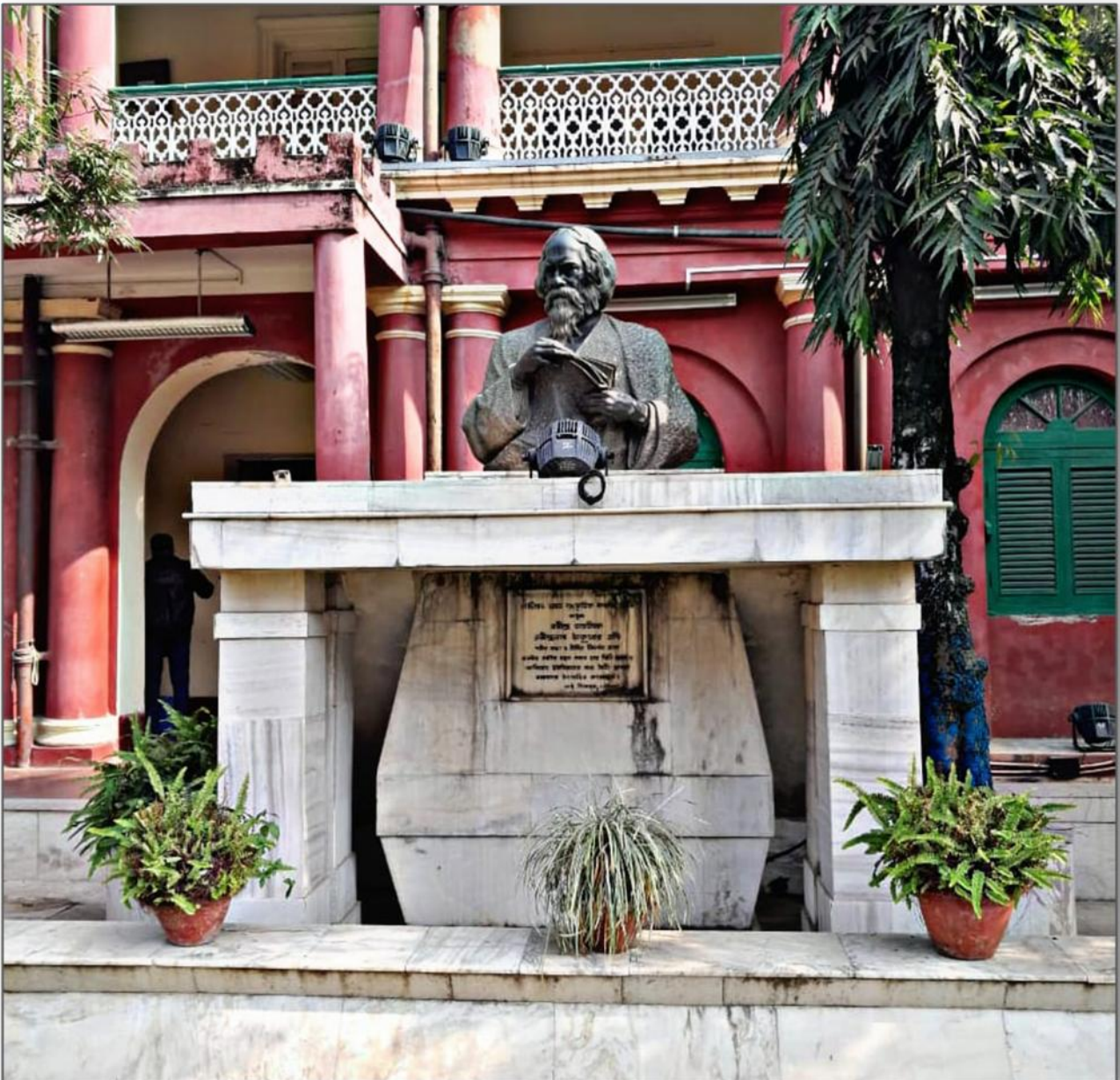
Jorasanko Thakur Bari