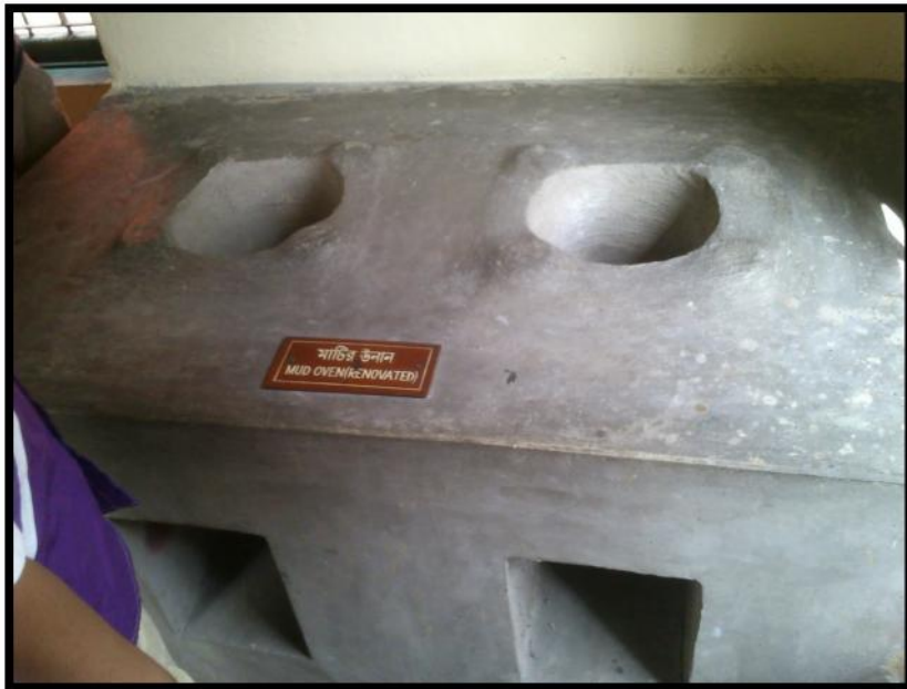
Kitchen of Mrinalini Devi